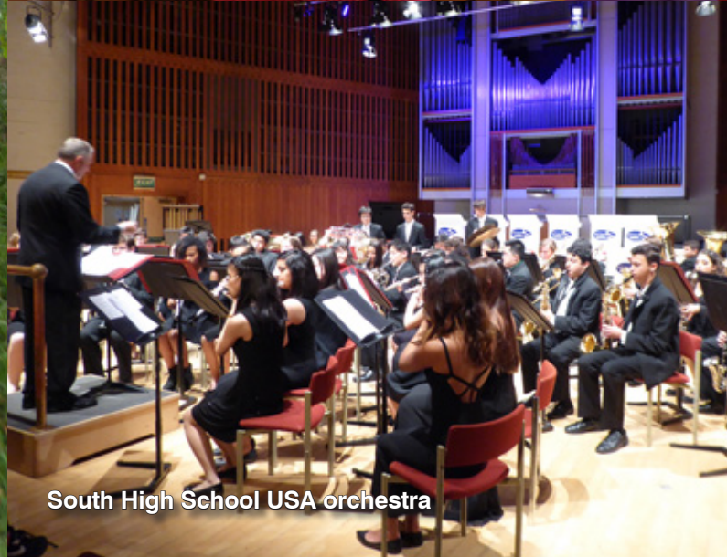
South High School USA orchestra