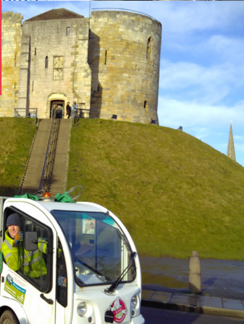
Clifford's Tower was our 100th business recycling customer