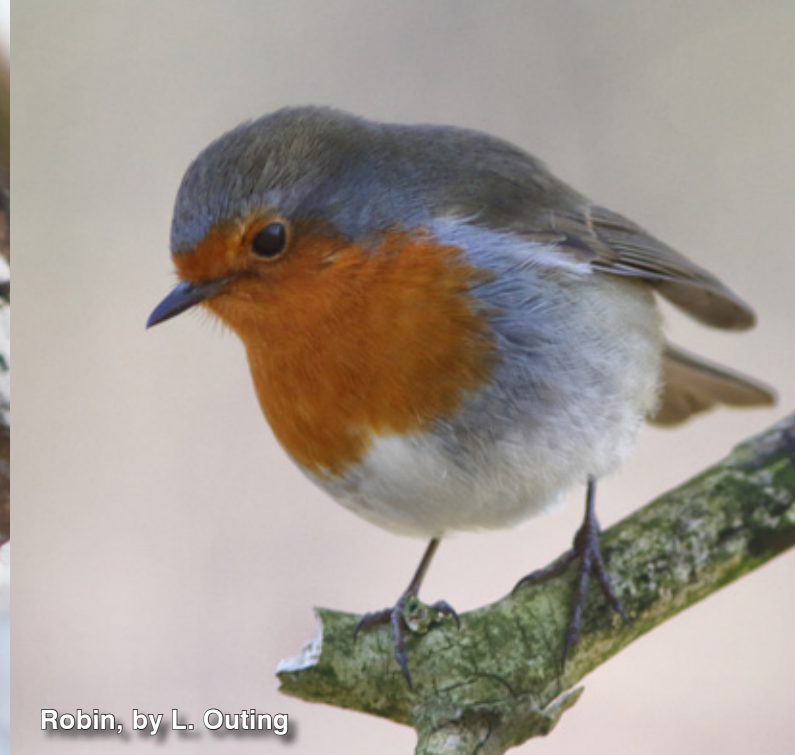
Robin