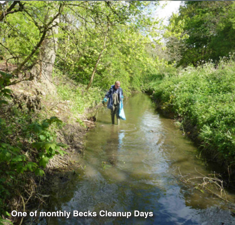
One of monthly Becks Cleanup Days

We also used this opportunity to link Derwenthorpe Wildwatch with our Nature Explores summer activities aimed at engaging children with their local environment. Families took part in pond dipping, pollinator prowls, mini-beast hunts and wildflower wanders as well as a Hedgehog Day at which they learnt about the endangered mammals and how we can all help them.