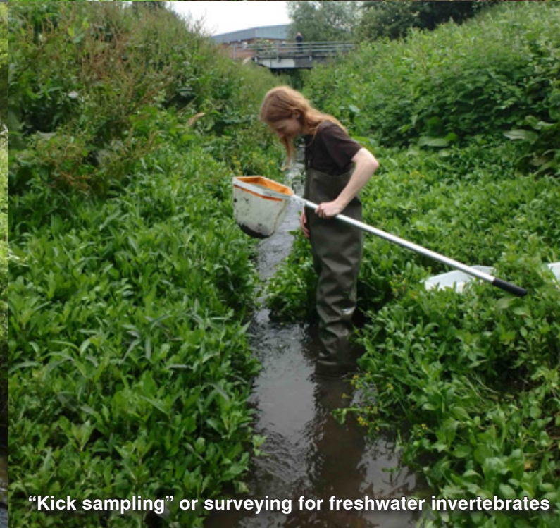
"Kick sampling" or surveying for freshwater invertebrates