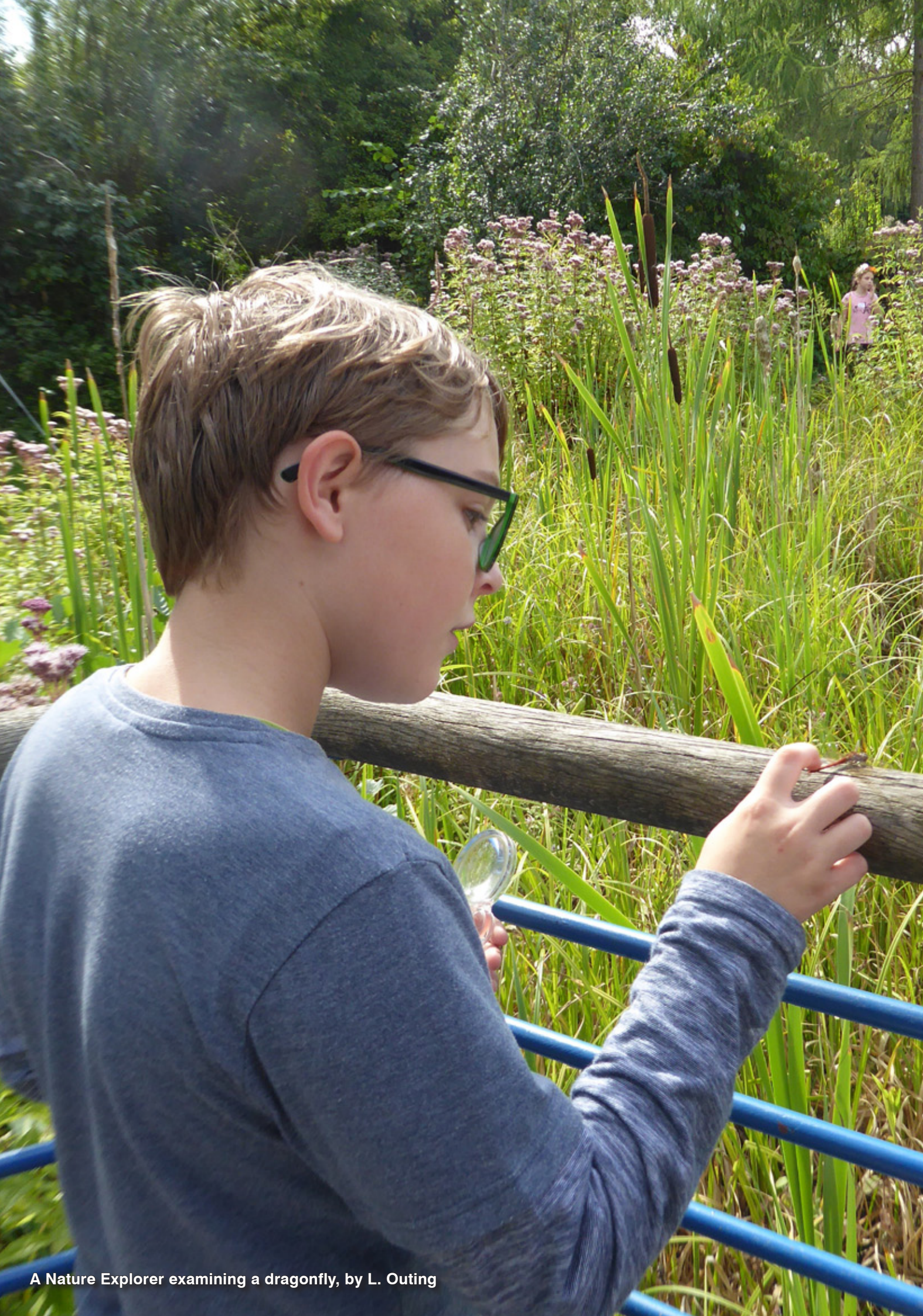
A Nature Explorer examining a dragonfly, by L. Outing