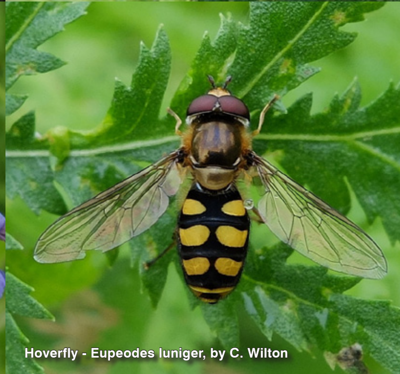
Hoverfly - Eucephalodes luniger, by C. Wilton

how they got here. Did they come up in the 2015 Boxing Day floods, did they go against all popular thinking and fly, or were they intentionally placed there? It's a mystery to us but what we do know is that if they manage to successfully breed and spread on the nature reserve, we have the potential of playing an important role in their conservation. With St Nicks located at the bottom of River Foss and Tang Hall and Osbaldwick Becks there is an opportunity to help them spread across the catchment. While we are hopeful that we can play a part in helping make these shiny little beetles more resilient in York, we are also very aware of their limitations which make them so endangered. We will therefore work with experts at the Tansy Beetle Action Group to ensure our efforts are coordinated and effective. Fingers crossed we can help them make St Nicks a permanent long-term home!