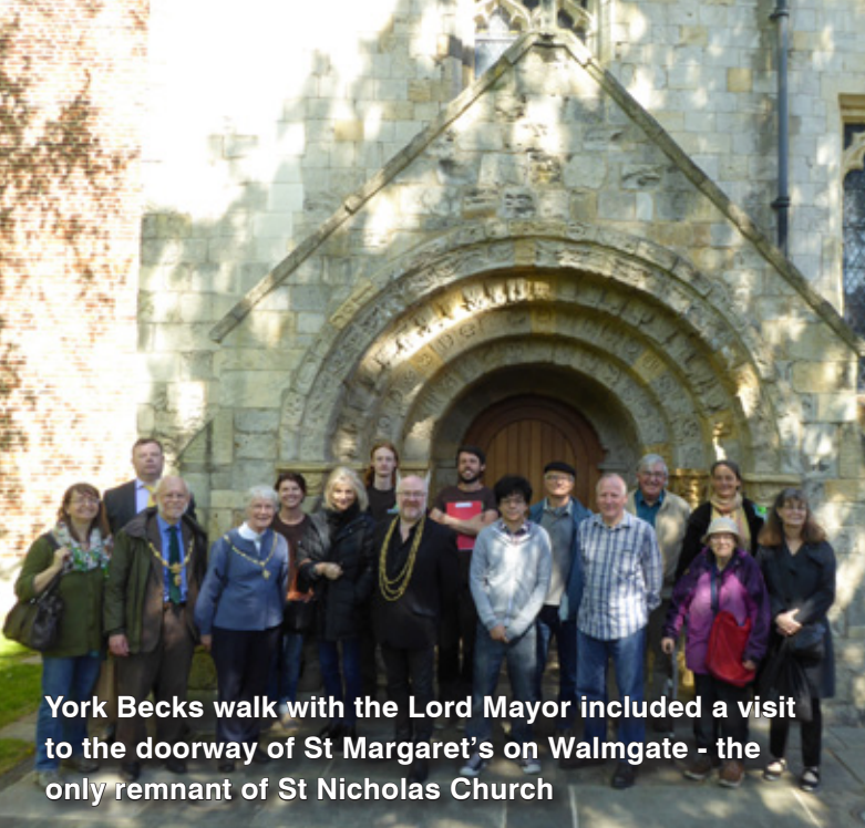
York Becks walk with the Lord Mayor included a visit to the doorway of St Margaret's on Walmgate - the only remnant of St Nicholas Church