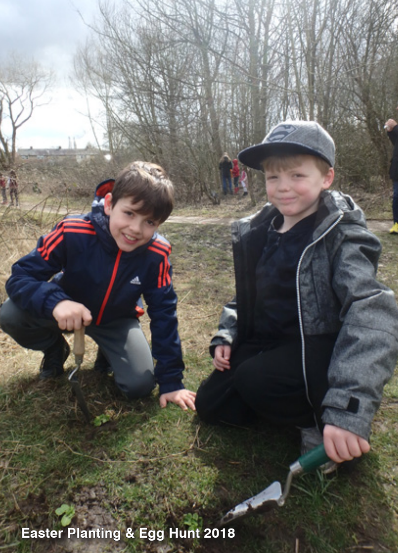
Easter Planting & Egg Hunt 2018