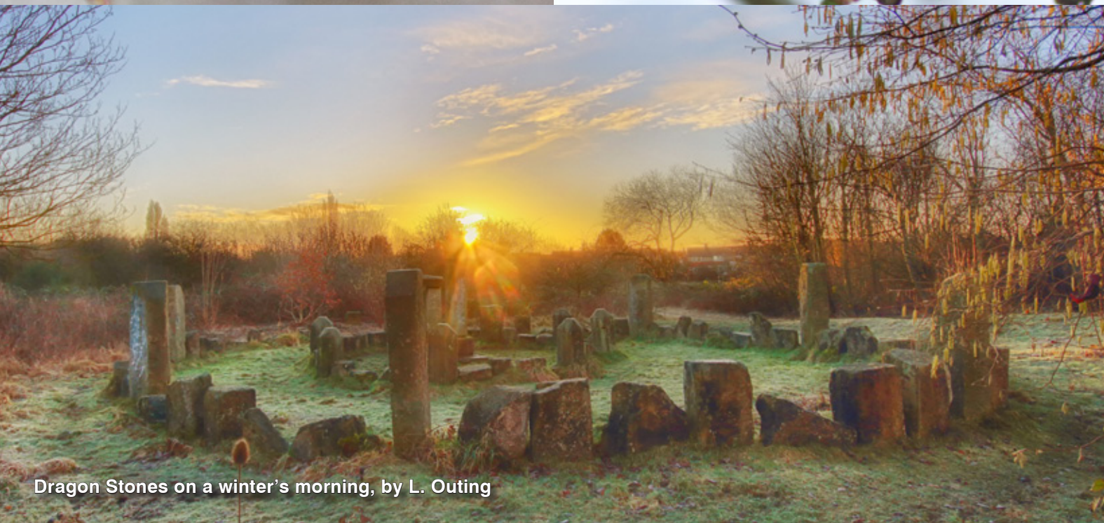
Dragon Stones on a winter's morning, by L. Outing