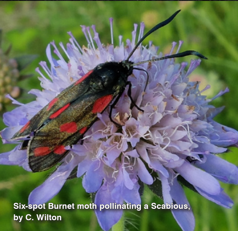
Six-spot Burnet moth pollinating a Scabious, by C. Wilton