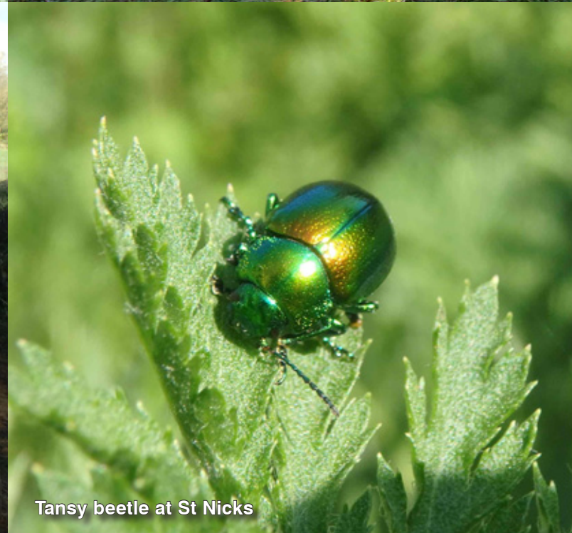
Tansy beetle at St Nicks