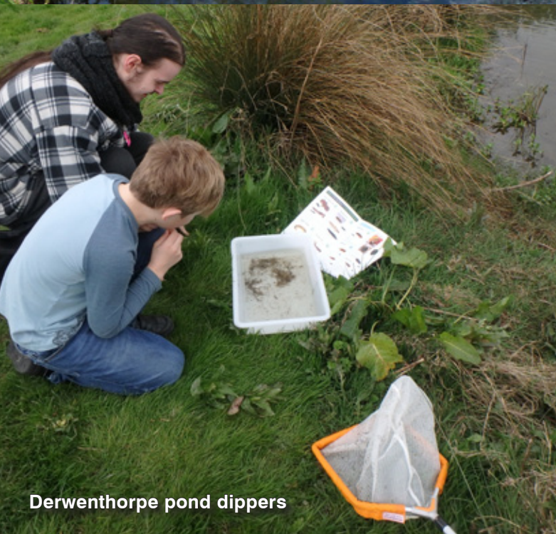
Derwenthorpe pond dippers