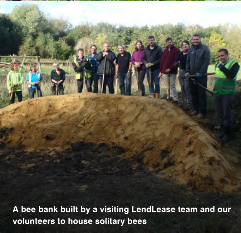
A bee bank built by a visiting LendLease team and our volunteers to house solitary bees