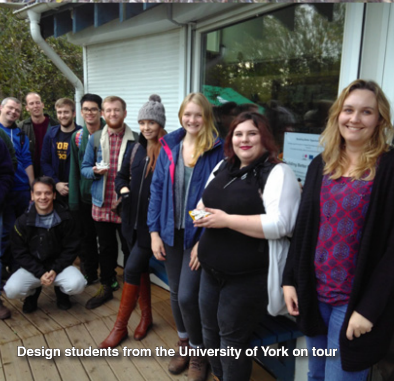
Design students from the University of York on tour