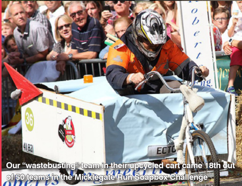
Our "wastebusting" team in their upcycled cart came 18th out of 50 teams in the Micklegate Run Soapbox Challenge