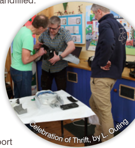
Celebration of Thrift, by L. Outing

Apart from recycling, we also focused more on reuse this year with Fix It Cafes. Over 6 sessions our fantastic Fixers were able to divert 378kg of waste from landfill. In total the team managed to successfully fix 16 pushbikes, 7 ornaments, 2 floor lamps, numerous sets of string lights, clothing, 3 vacuum cleaners and an angle grinder amongst other things! We held two weekend sessions during which all of the bikes were fixed and 4 evening sessions which drew smaller numbers but meant visitors got hands on and learnt how to fix their own items. We had visitors from around York, including Tang Hall, Bishophill and students from both universities.