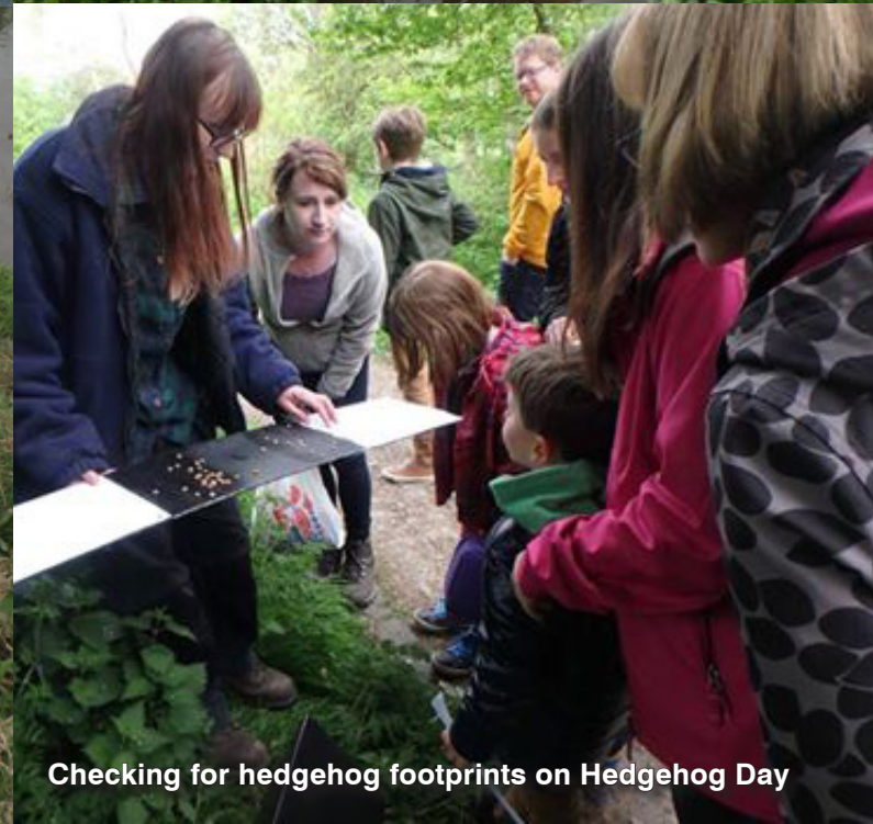
Checking for hedgehog footprints on Hedgehog Day