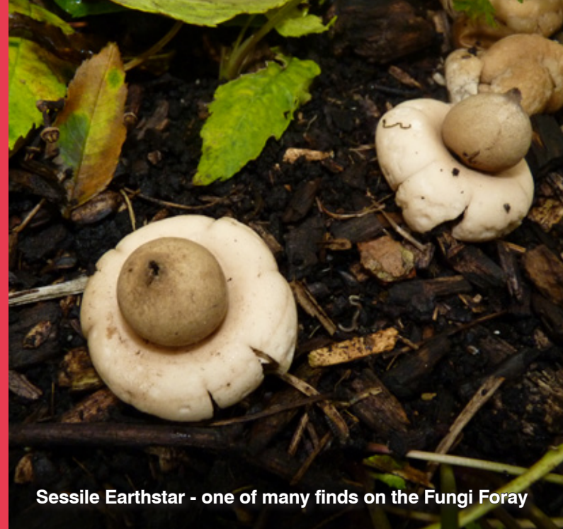
Sessile Earthstar - one of many finds on the Fungi Foray

“Wonderful - newts, journey sticks, memory game - we learnt a lot. The session leaders were so lovely and knowledgeable.”