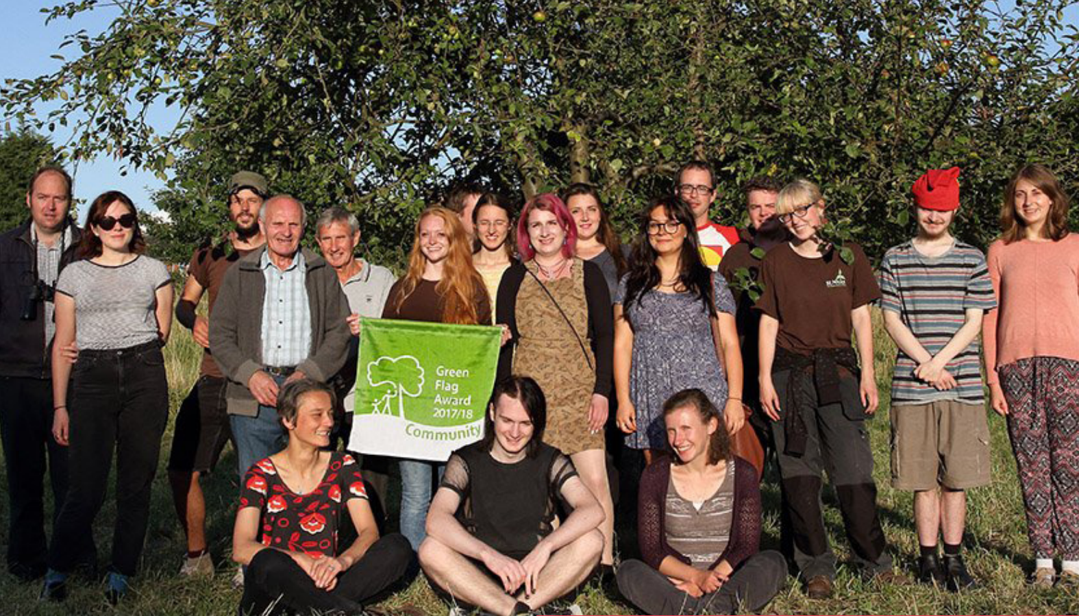
Volunteers and staff celebrating the latest Community Green Flag Award at the summer social

Increased daily volunteer numbers during 2017-18 also meant we needed to increase the number of supervisors out on the nature reserve. We took this opportunity to create a new volunteer support role helping our Volunteer Park Ranger in supervising the volunteers during practical tasks. This Support Volunteer role is designed to assist our Park Ranger in ensuring the groups are working safely with the correct equipment and everyone is comfortable in the tasks they are doing.