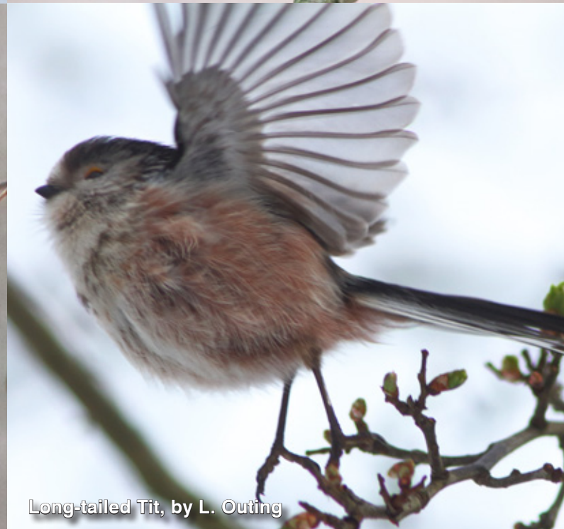
Long-tailed Tit, by L. Outing