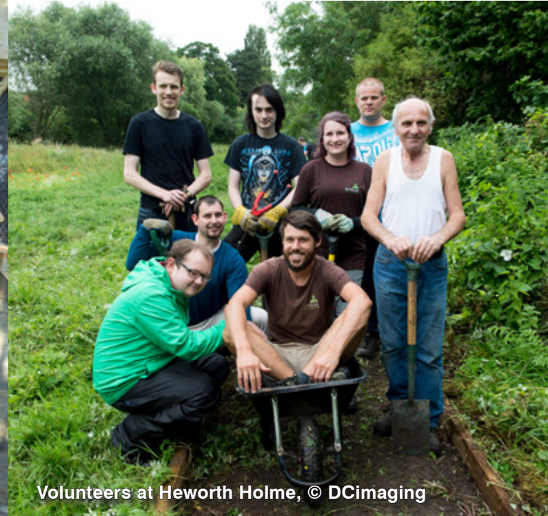
Volunteers at Heworth Holme, © DCimaging

This has led to a range of simple monitoring techniques being developed to be used in the coming year with the project groups. With the success of and interest in the project we will also be starting Champions training to help ensure sustainability of the project beyond the funding period and will continue developing an easy-to-use training toolkit for each site with step by step guides to scything and grassland monitoring methods. A range of community events also took place to inspire and engage 314 people in the project.