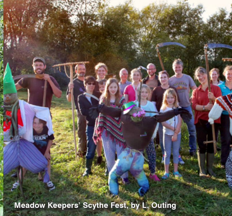
Meadow Keepers' Scythe Fest