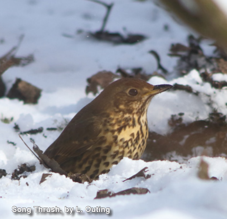
Song Thrush, by L. Outing