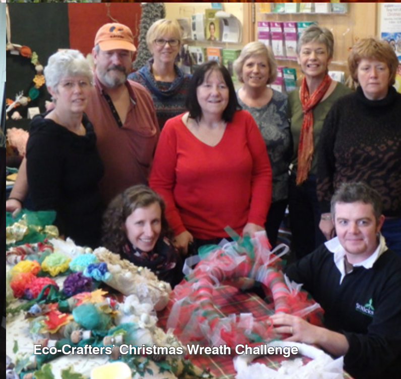
Eco-Crafters' Christmas Wreath Challenge