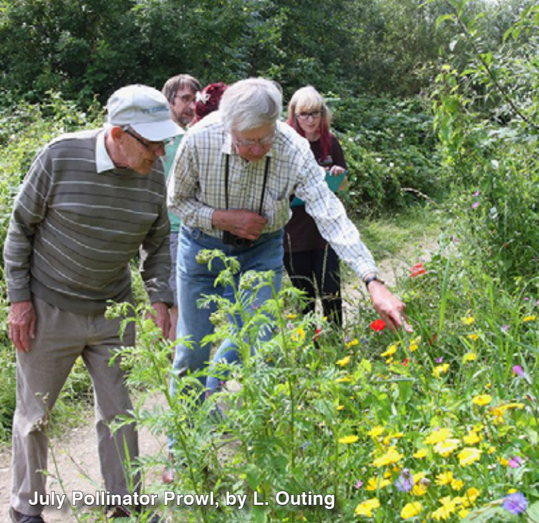
July Pollinator Prowl