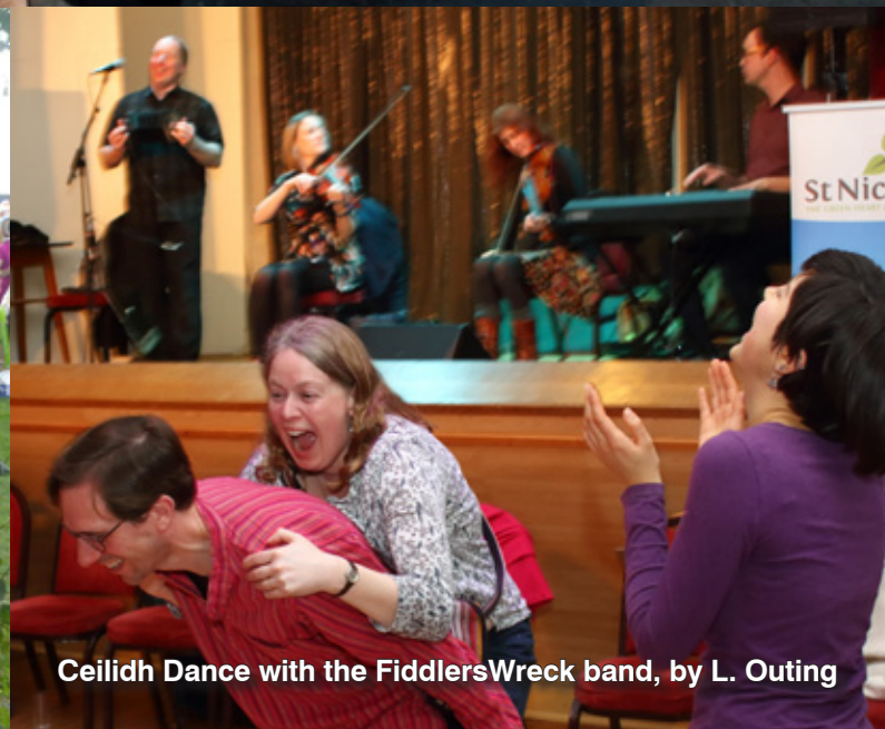
Ceilidh Dance with the FiddlersWreck band, by L. Outing