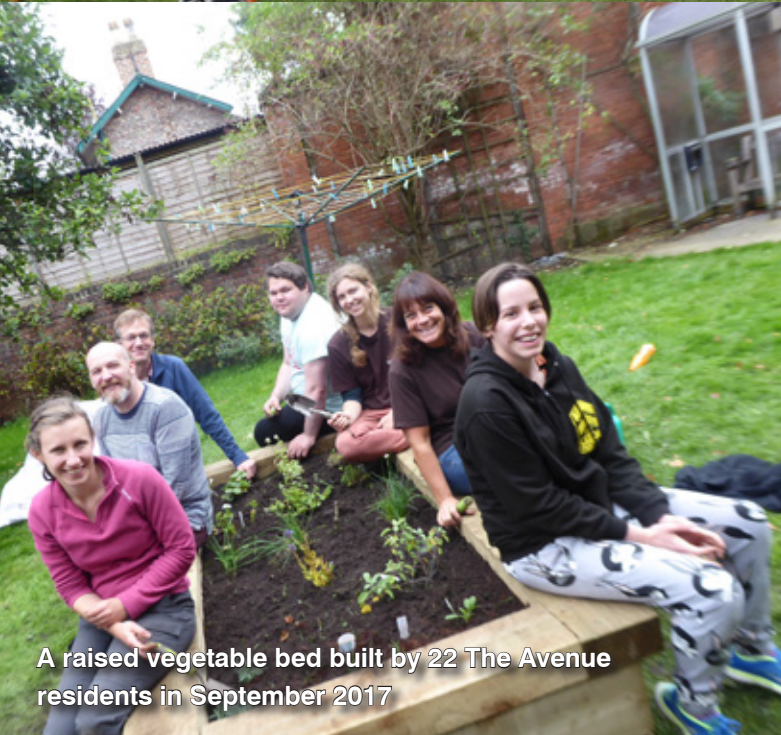
A raised vegetable bed built by 22 The Avenue residents in September 2017