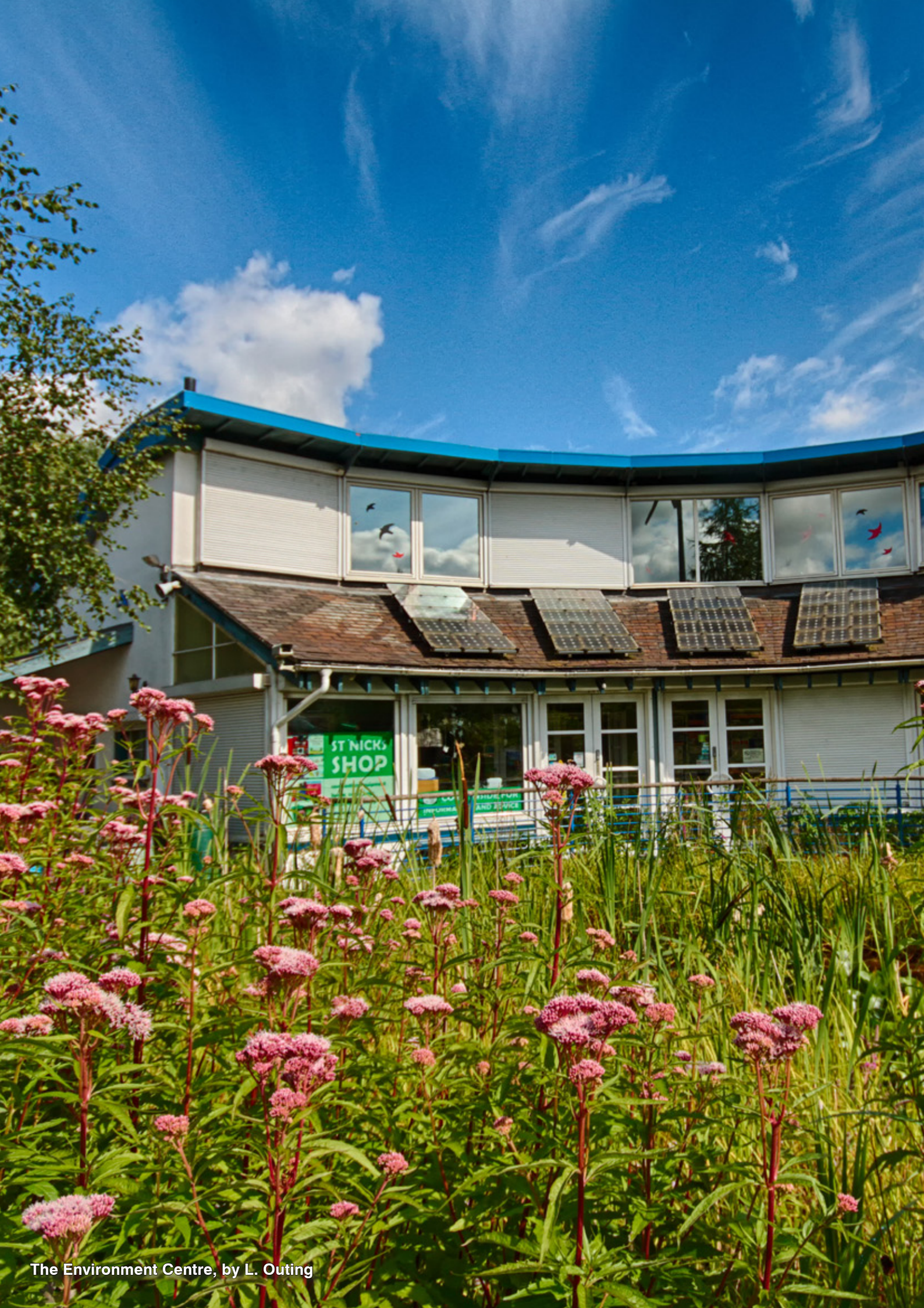
The Environment Centre, by L. Outing