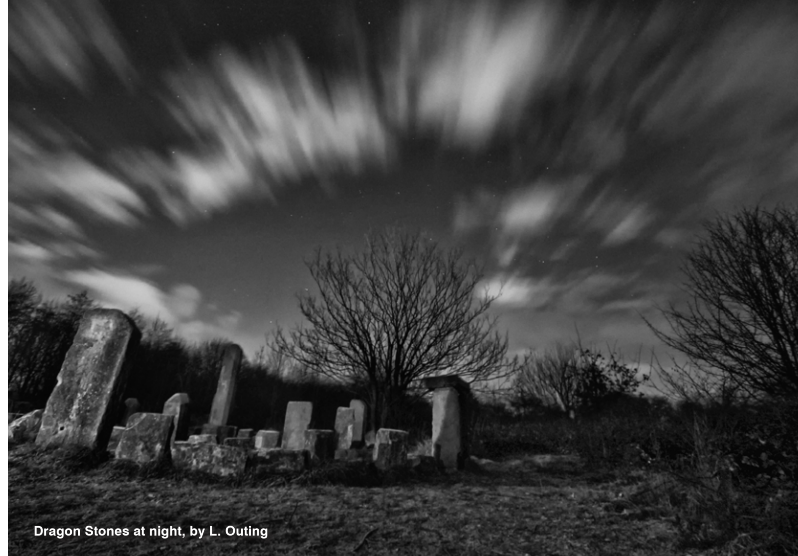
Dragon Stones at night, by L. Outing