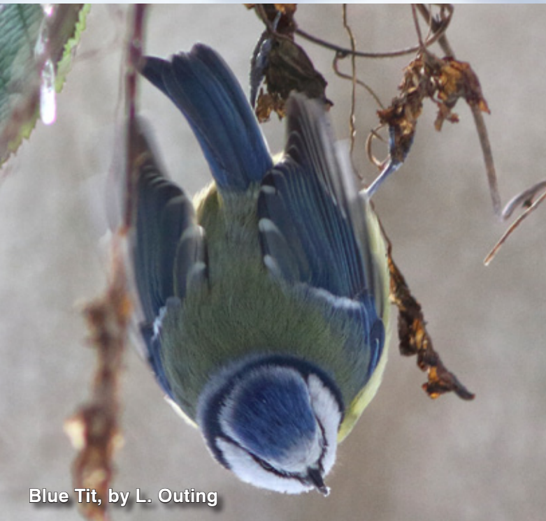
Blue Tit, by L. Outing